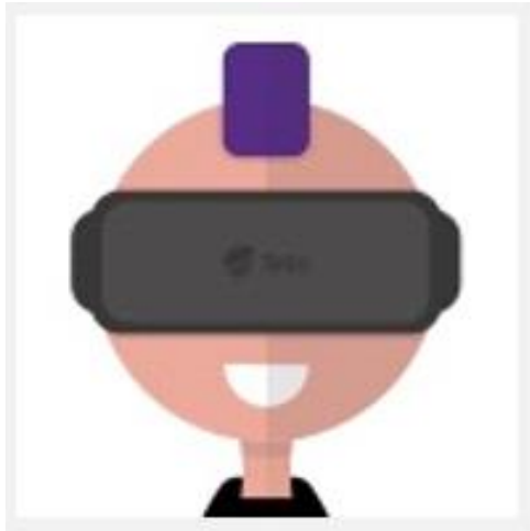
TECH-SAVVY BOY PUSHING THE BOUNDARIES