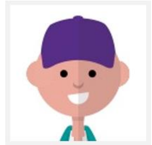
VULNERABLE CHILD NEEDING SUPPORT