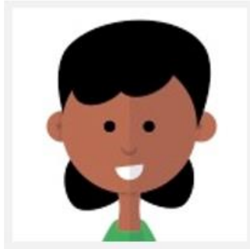
REGULAR KID ENJOYING THE OPPORTUNITIES